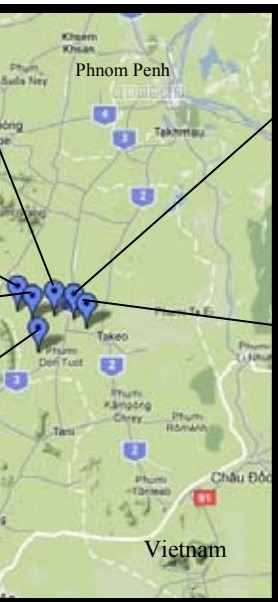
A Goggle Earth map

The six schools the Trust currently supports are all in Takeo province about one and half hours drive south of Phnom Penh. It is a rural area, with schools located on dusty roads amongst rice fields. In total about 7854 children attended these schools.