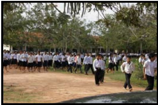
When we visited Angroka High School (2435 students) the pupils had just finished assembly and were heading towards the classrooms. Children everywhere! It will be a real challenge to get an adequate supply of books for such a large school.