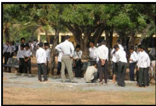
The grounds at Ang Run Junior High School (599 students) were beautifully laid out with vegetable and flower beds plus this petanque ground. All of the work has been done by the students and teachers. They were delighted to know that they were going to have books for their empty library shelves that they had made.