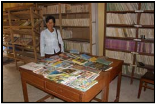
What's on that table was the full range in the library at Tnort Chum Junior High School ( 622 students) before the Trust supplied books. All the books on the shelves are text books.